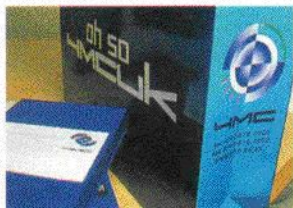
Editing suites in St Anne's Court are just one of the changes introduced by 4MC to its new UK branch

have a lot more trust in the people than Carlton did."